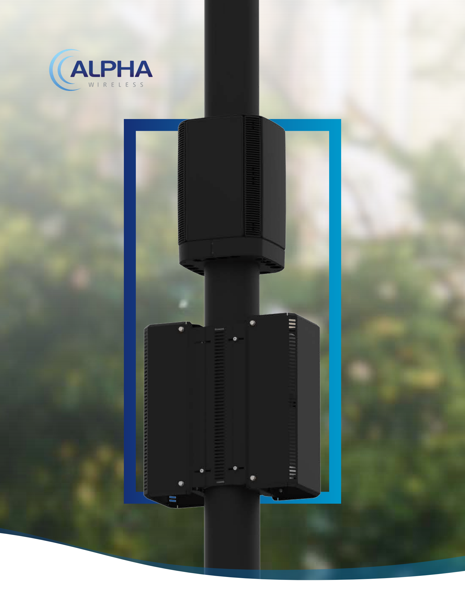
Telecom Streetworks Solutions™