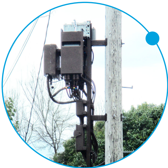
TRADITIONAL APPROACH TO SMALL CELLS