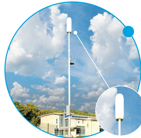
CAN DEPLOYMENT, KANSAS CITY, USA