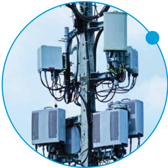
TRADITIONAL APPROACH TO SMALL CELLS